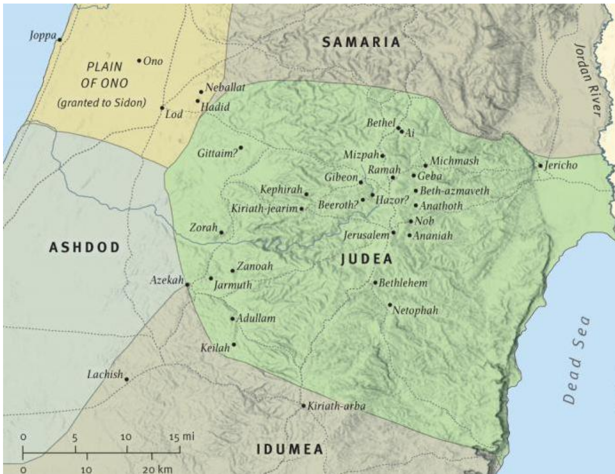
Judæa under Persian Rule 538-332 BC