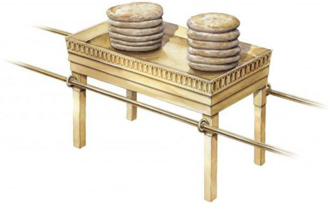
The Showbread on its table