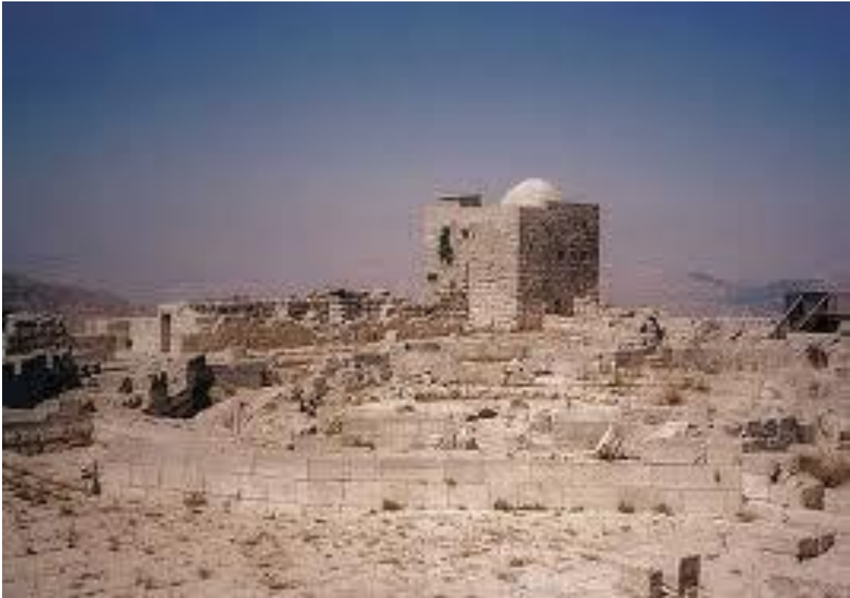
The Temple on Mount Gerizim