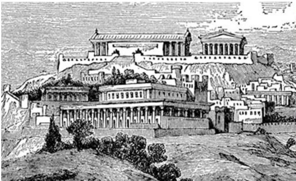
Image of the city of Susa - the Persian winter residence