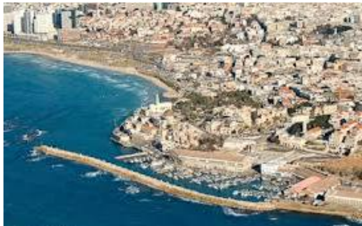
The Harbour at Joppa