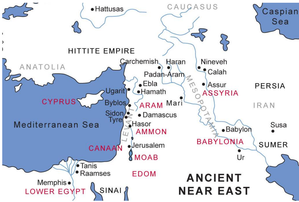
Nineveh in relation to Jerusalem