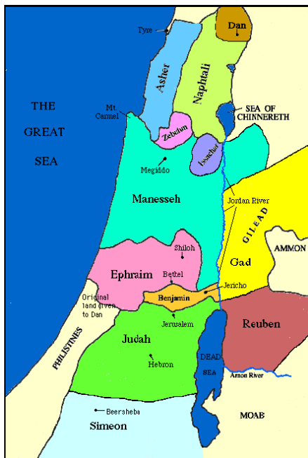
Land Allocation to the Twelve Tribes