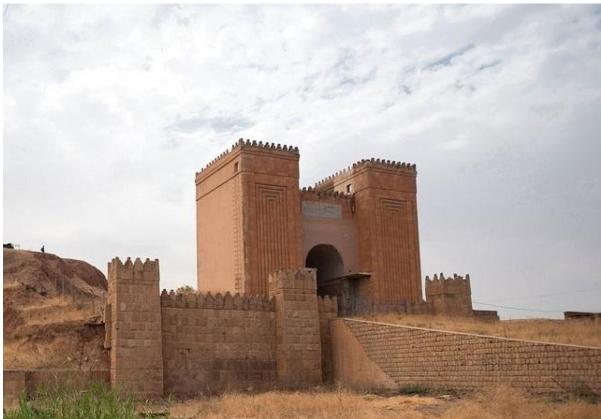
The Mashki Gate at Nineveh