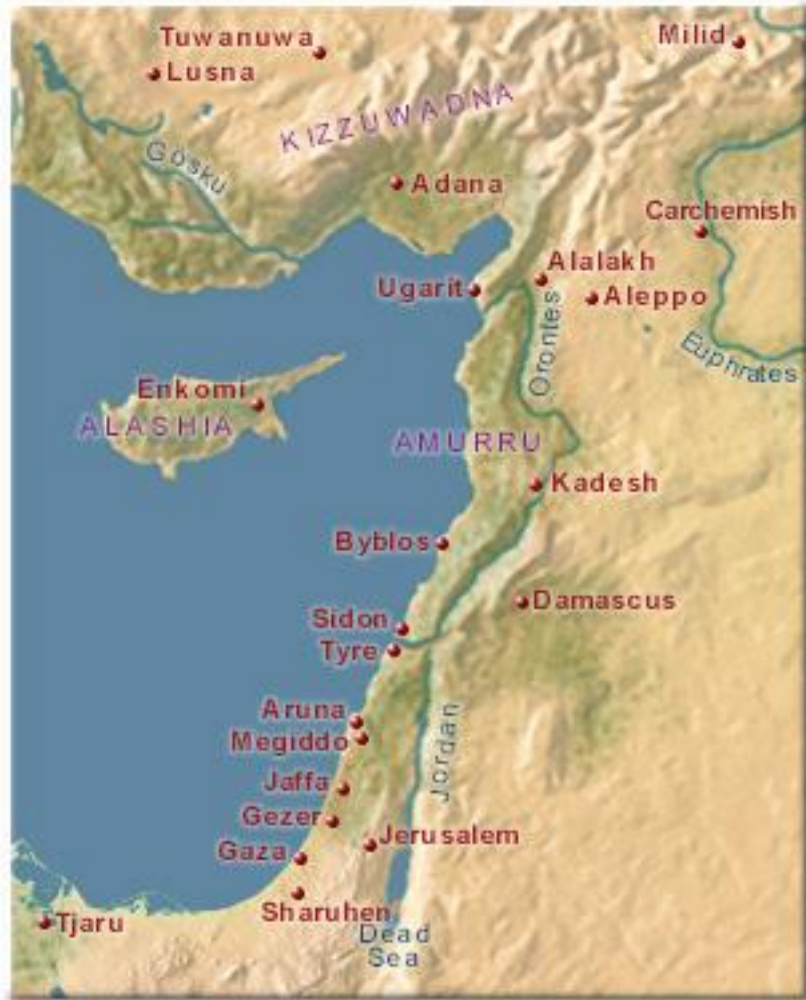
The map shows Tyre and Sidon in relation to Jaffa and Jerusalem