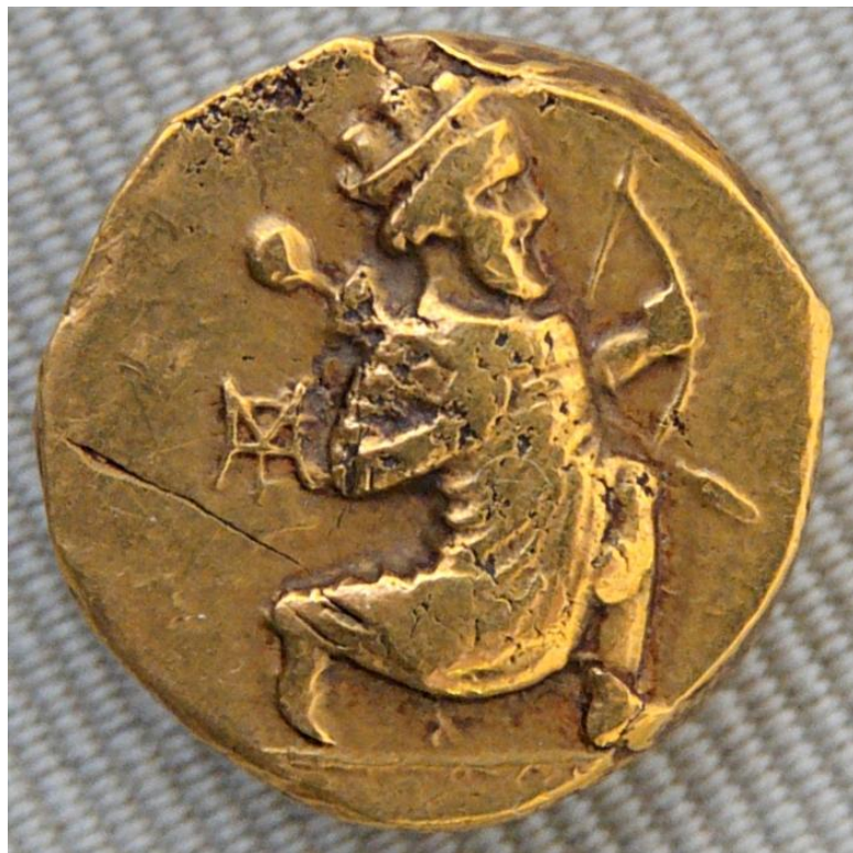
A typical daric