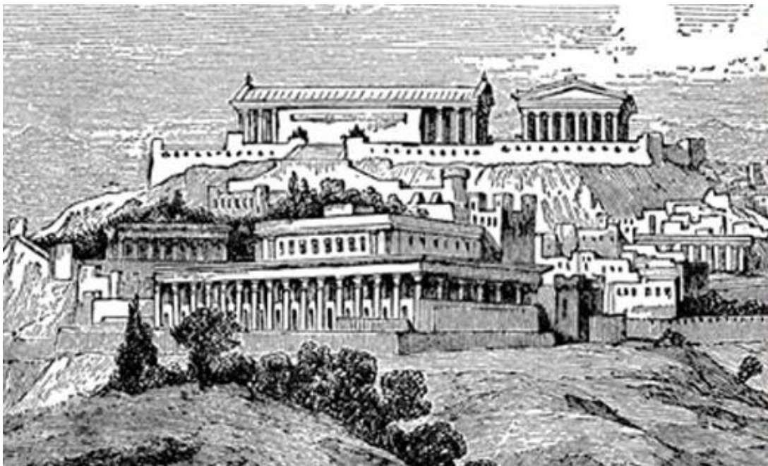
Image of Susa - winter capital of the Persian Empire