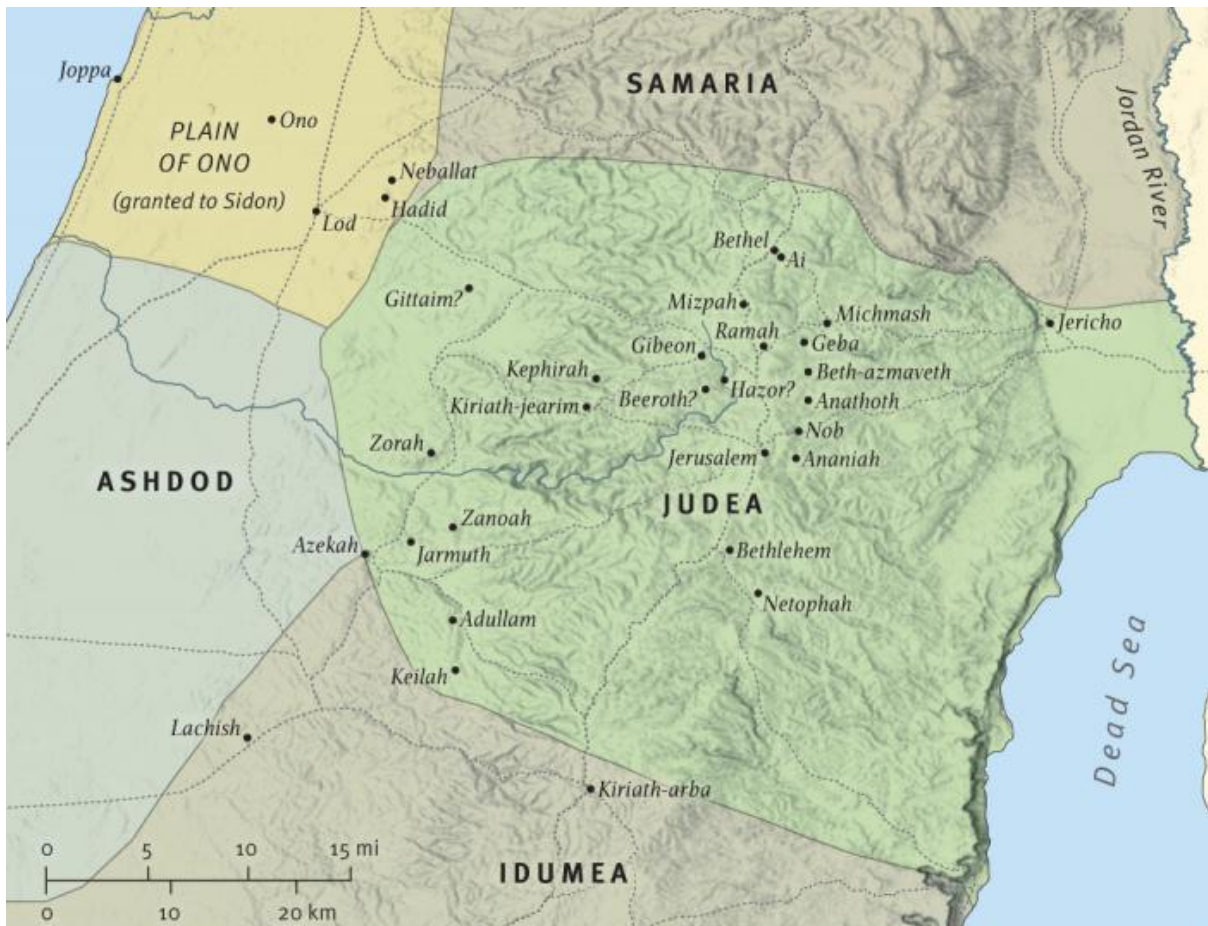
Judæa under Persian Rule 538-332 BC