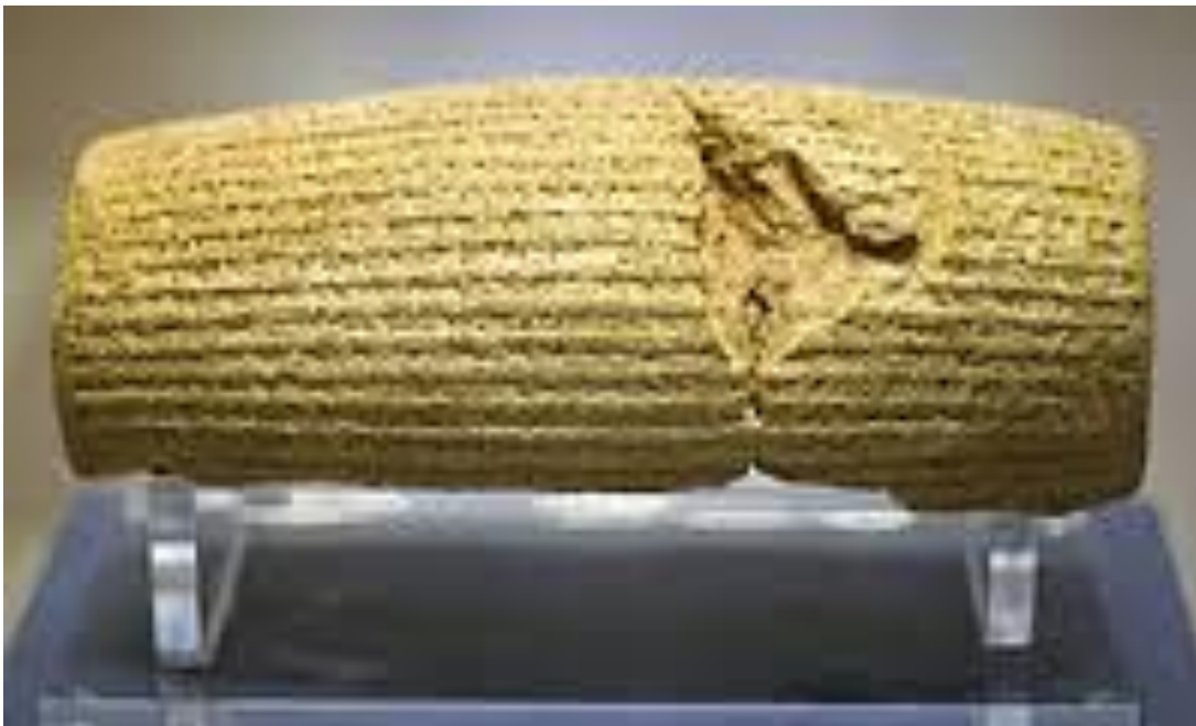
The Cyrus Cylinder