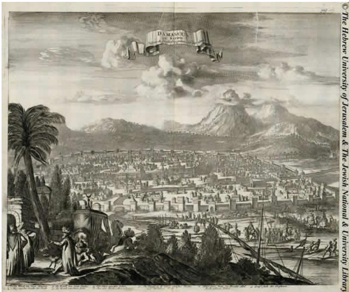
Damascus by 17 th Century Dutch Physician Olfert Dapper