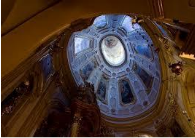
Ornate church ceilings are designed to draw worshippers' eyes upwards toward heaven.