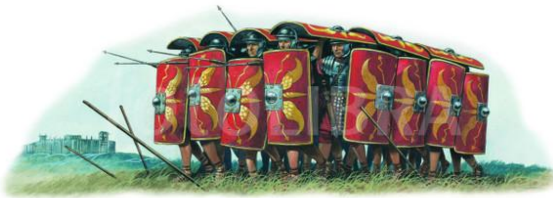
A Roman Testudo