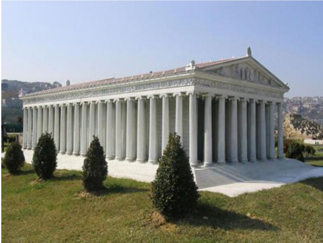
The Reconstructed Temple to Artemis