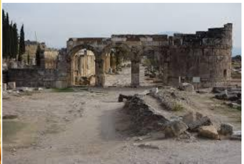
The Domitian Gates - Hierapolis