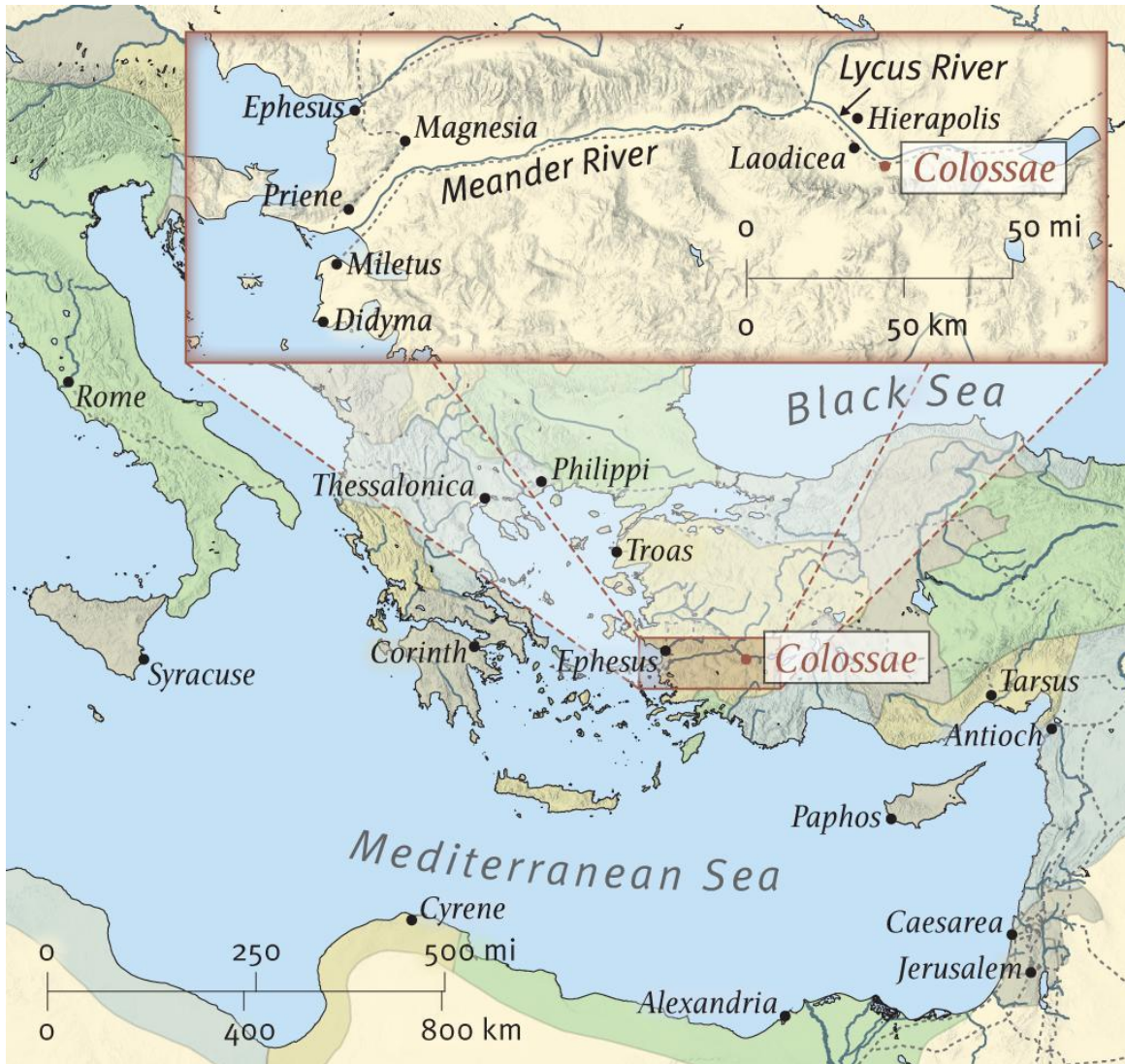
Regional Map of Colossae