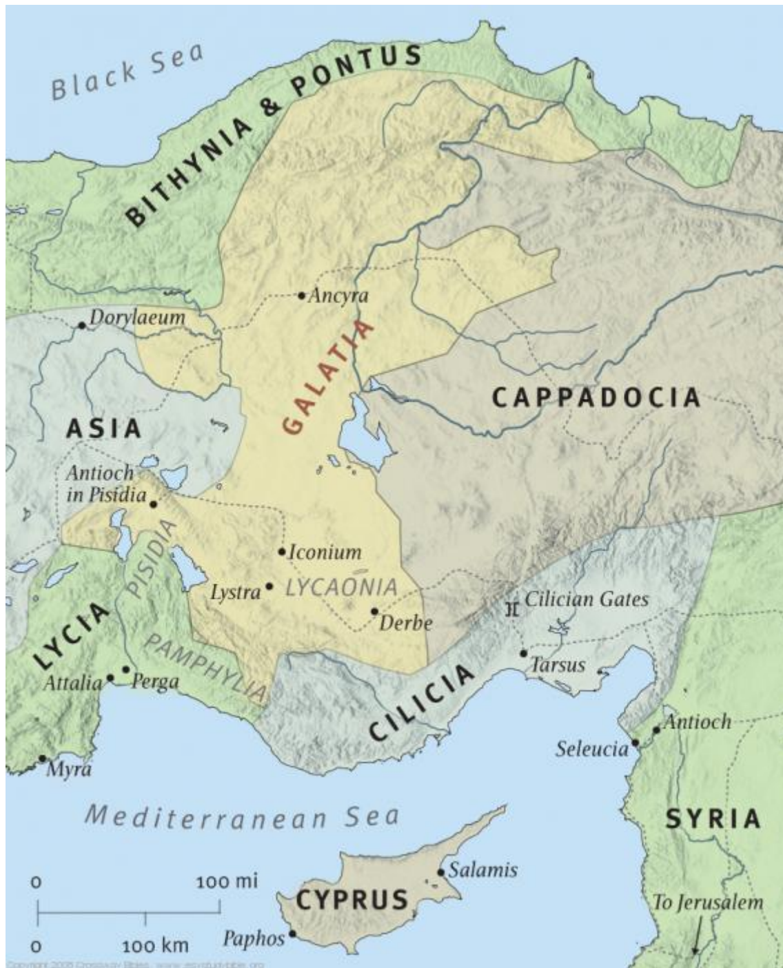
Paul refers to his letter to the Galatians in Chapter 16